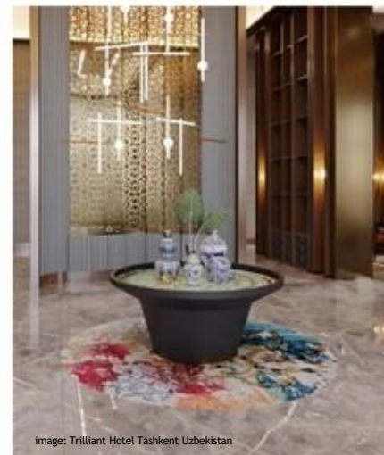
image: Trilliant Hotel Tashkent Uzbekistan