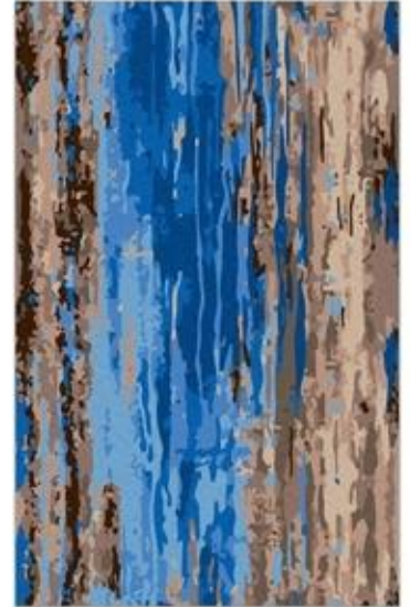
Design: River Hand Tufted %100 Wool (Available in Viscose or Viscose-Wool Mixed) Custom sizes are available Custom colors are available