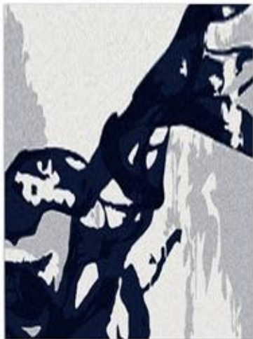
Design: Confusion Hand Tufted %100 Wool (Available in Viscose or Viscose-Wool Mixed) Custom sizes are available Custom colors are available