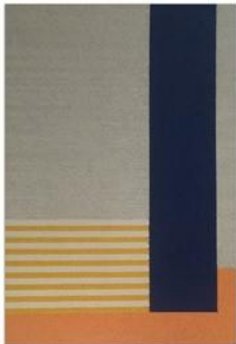
Design: Path Hand Tufted %100 Wool (Available in Viscose or Viscose-Wool Mixed) Custom sizes are available Custom colors are available