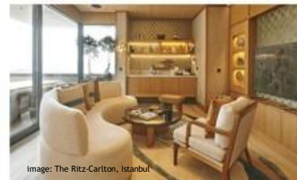
image: The Ritz-Carlton, Istanbul