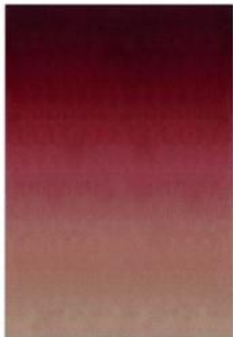
Design: Gradient Hand Tufted %100 Wool (Available in Viscose or Viscose-Wool Mixed) Custom sizes are available Custom colors are available