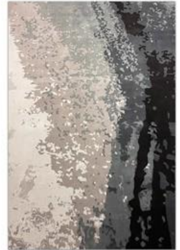
Design: Shade Hand Tufted %100 Wool (Available in Viscose or Viscose-Wool Mixed) Custom sizes are available Custom colors are available