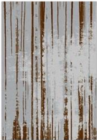
Design: Wiped Hand Tufted %100 Wool (Available in Viscose or Viscose-Wool Mixed) Custom sizes are available Custom colors are available